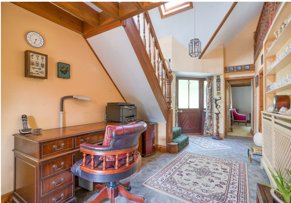
Cabin Room 2 15'6" x 7'7"